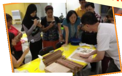
Clay & Modelling