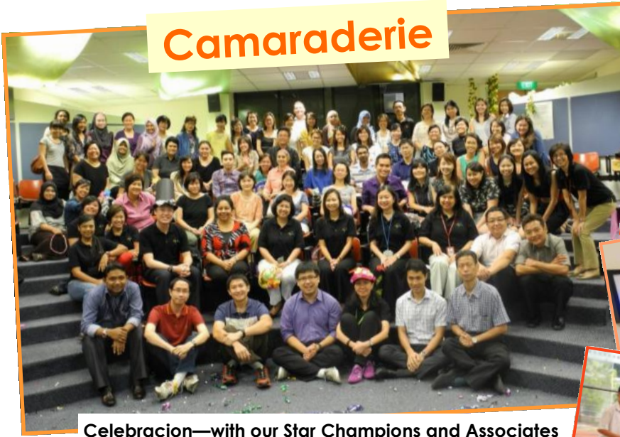
Celebration—with our Star Champions and Associates