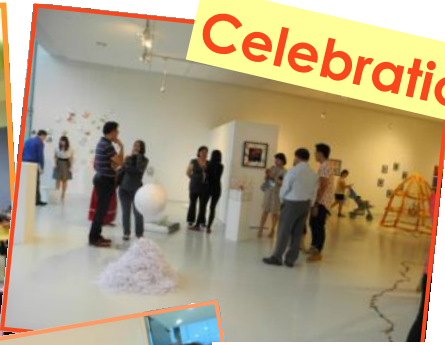
ADPAE Grad Show