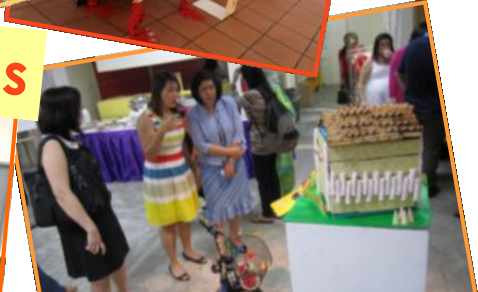
ATPP Grad Show