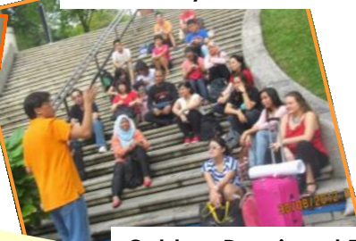
Outdoor Drawing at Fort Canning