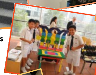
A is for Art 2012