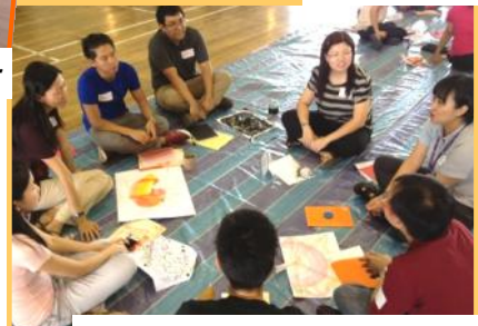
Beginning Teachers' Induction