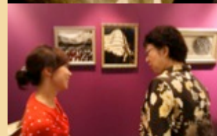
Above: Images from last year's exhibition at Sculpture Square