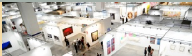
Aerial View from Art Stage Singapore 2012

Check out event's website for more details - http://www.artstagesingapore.com/