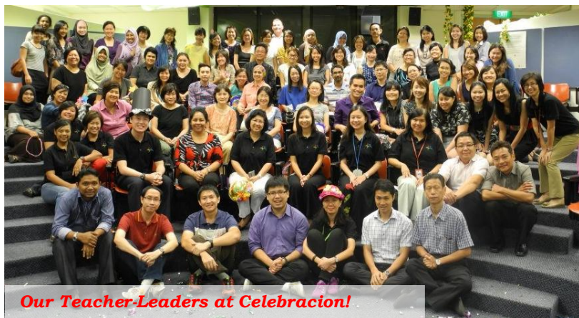
Our Teacher-Leaders at Celebracion!

In just a blink of an eye, we have arrived at the end of another school year. Time has so quickly whizzed by! Schools are now abuzz with camps, overseas trips and, for secondary schools, open houses. All the best to your upcoming events!