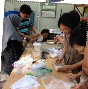
Creating sprigs with Plaster of Paris & then..