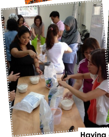
Having a go at Papier Mache!