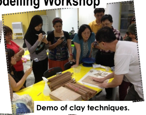
Demo of clay techniques.