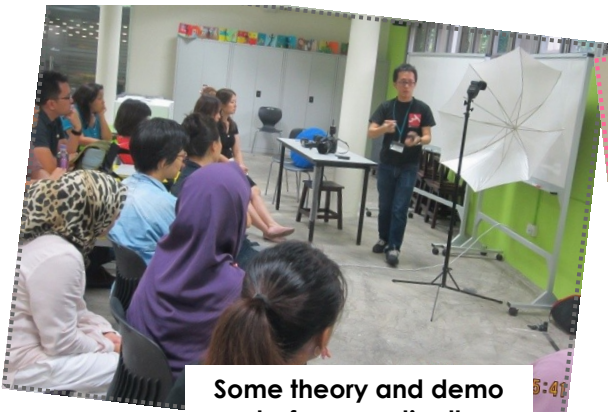
Some theory and demo before practical!