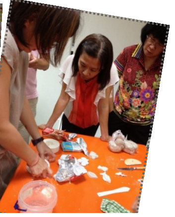
Putting the sprigs to the test!