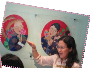
The old in the new!