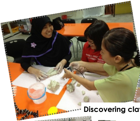
Discovering clay through play.