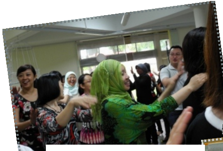
Warming up for the day!