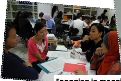
Engaging in meaningful discussion!