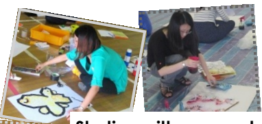
Starting with some art making!