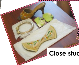
Close study of traditional objects