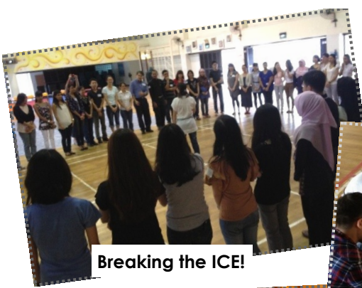
Breaking the ICE!